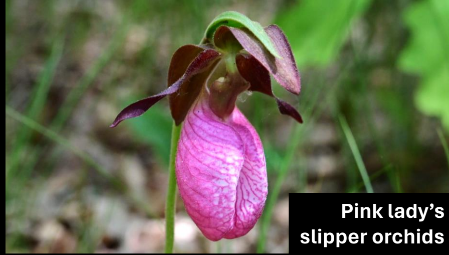
Pink lady's slipper orchids